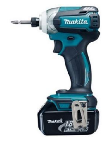
Above: Makita LXDT06 brushless impact driver

The impact mechanism kicks in at the slower speed to provide for a more precise driving action.