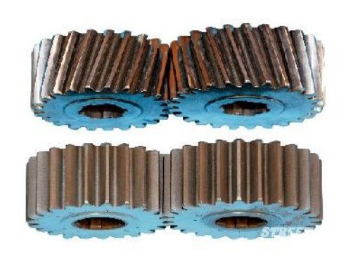
Above: Helical versus Spur gears Left: Spur gear geometry

Re gear types, helical gears are the pick for transmissions for 2 main reasons. 1. They are stronger. 2. They are quieter. They are stronger because with the tooth on an angle, you are bending it around two axis, and the width of the face is longer so the pressures are lower. The downside is though, they create an axial thrust which needs to be dealt with. They also don't like being engaged with one another without their speed being synchronised. A spur gear will being perpendicular, can slide in and out of mesh a lot easier deleting the need for synchronisation rings (in some cases) in what commonly known as 'dog engagement'.