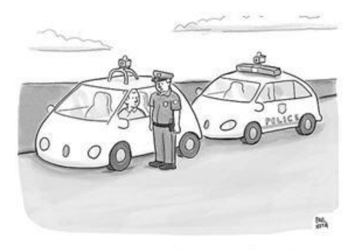
"Does your car have any idea why my car pulled it over?"