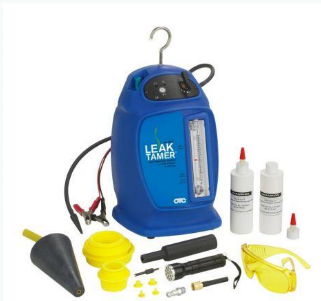
Figure 1 - A common smoke tester with accessories

There are many brands of unit on the market, however they all follow the same formula of injecting a UV dye mixed with nontoxic smoke. The smoke is identified by viewed using a UV torch and matching glasses. Some units have their own compressor built in while others require external supply.